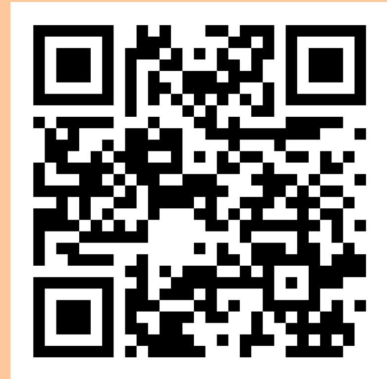
CONTACT US D75COUNCIL@SCHOOLS.NYC.GOV